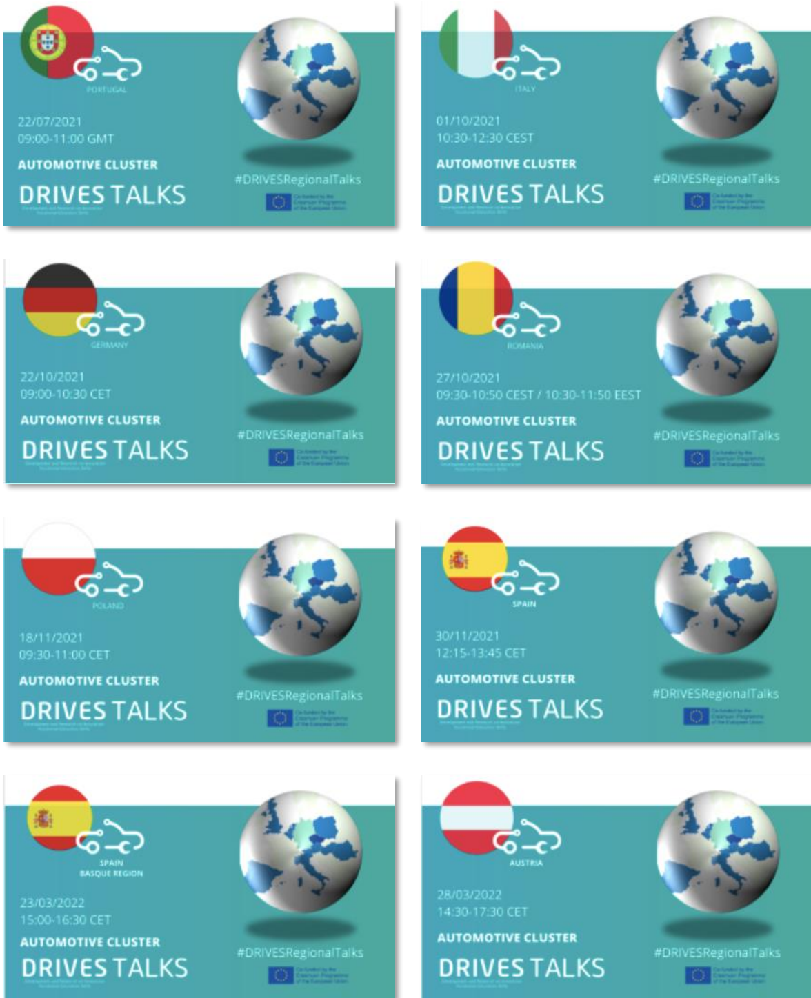
Figure 2 The set of #DRIVESRegionalTalks